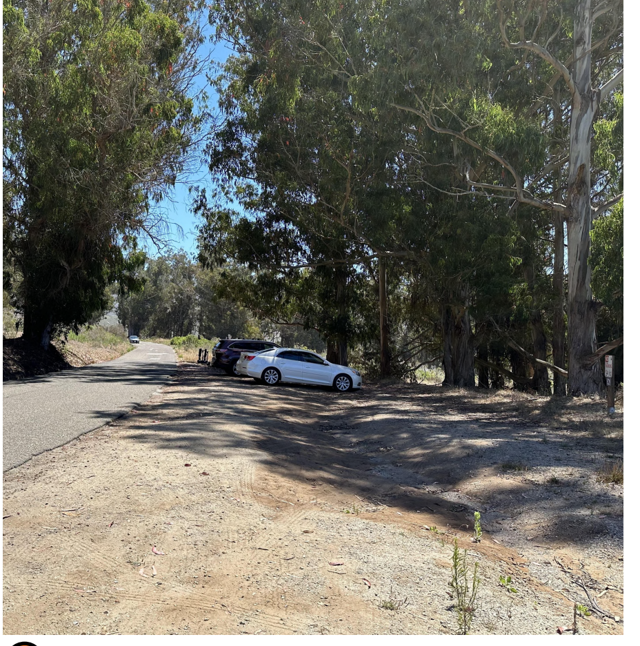
17 Parking along Lower State Park

16 Morro Bay Estuary from Lower State Park