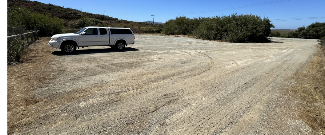
Cerro Cabrillo Trailhead Parking 11