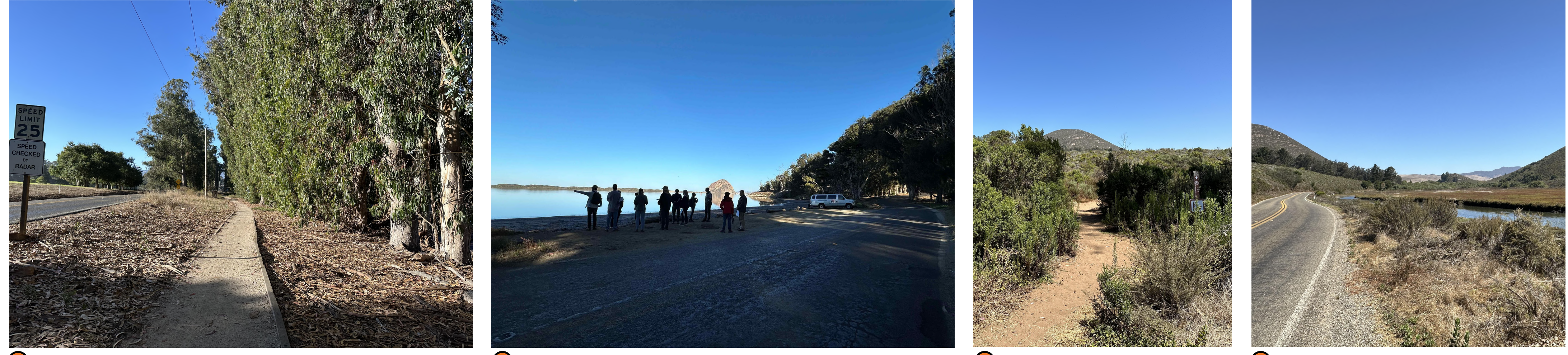
Pedestrian Route from Main St to Windy Cove