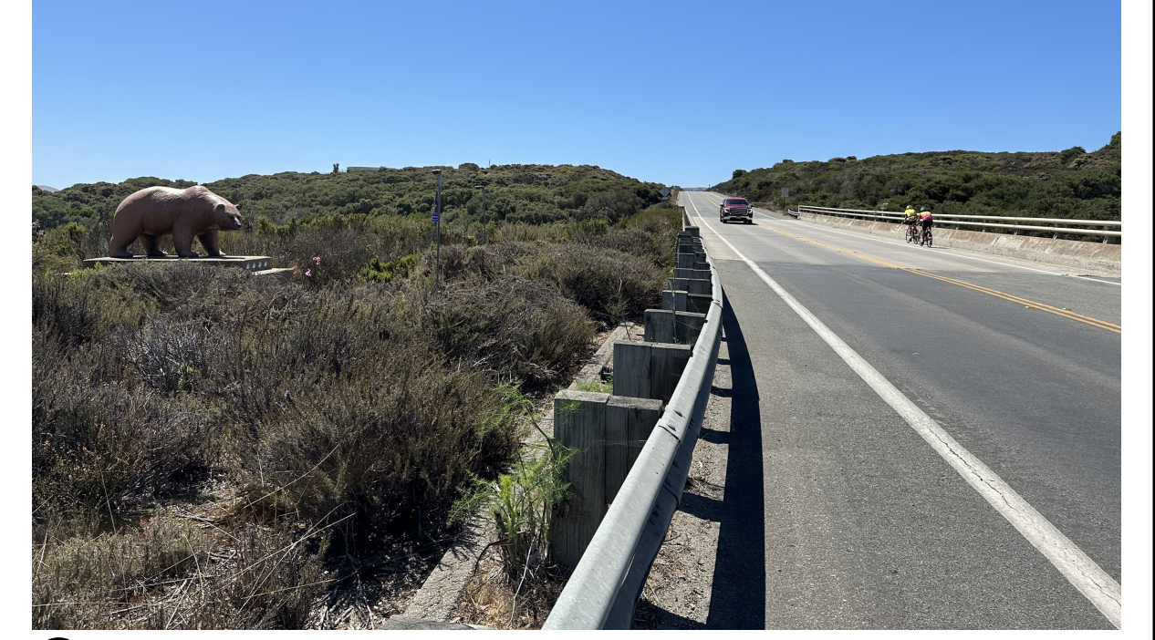
14 South Bay Bridge, Class II Bike Lanes, and Los Osos Bear